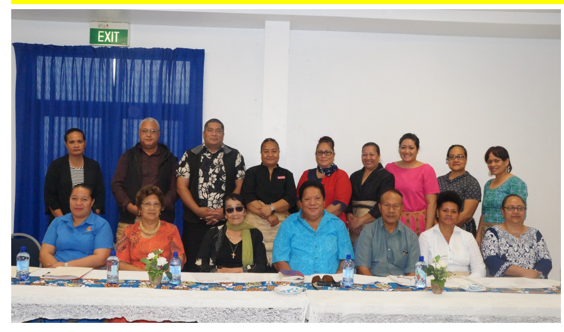
Right: Representatives from Tourism Industry, Regulating Authorities and Ministry of Tourism with staff of TNQAB in its first workshop training for on roles and responsibilities of ITAC—Tourism